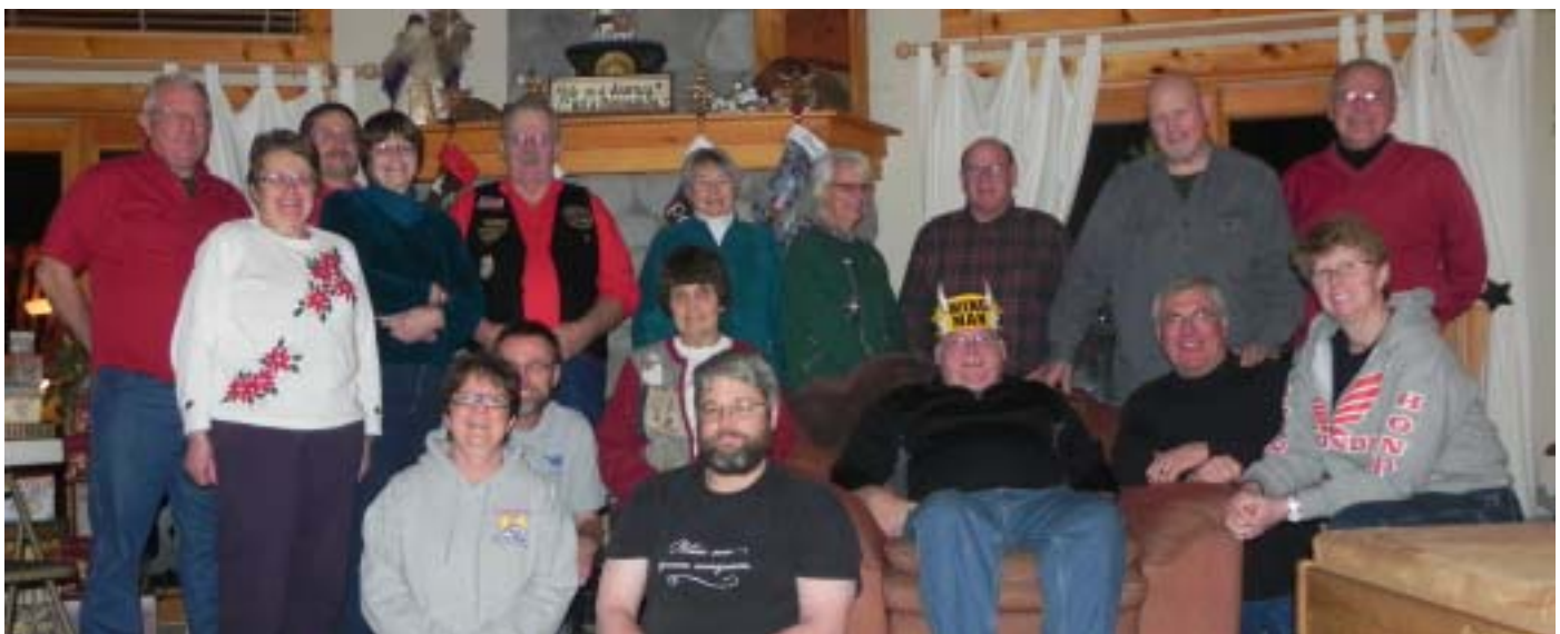
Below: Picture of group at Eames' New Years party