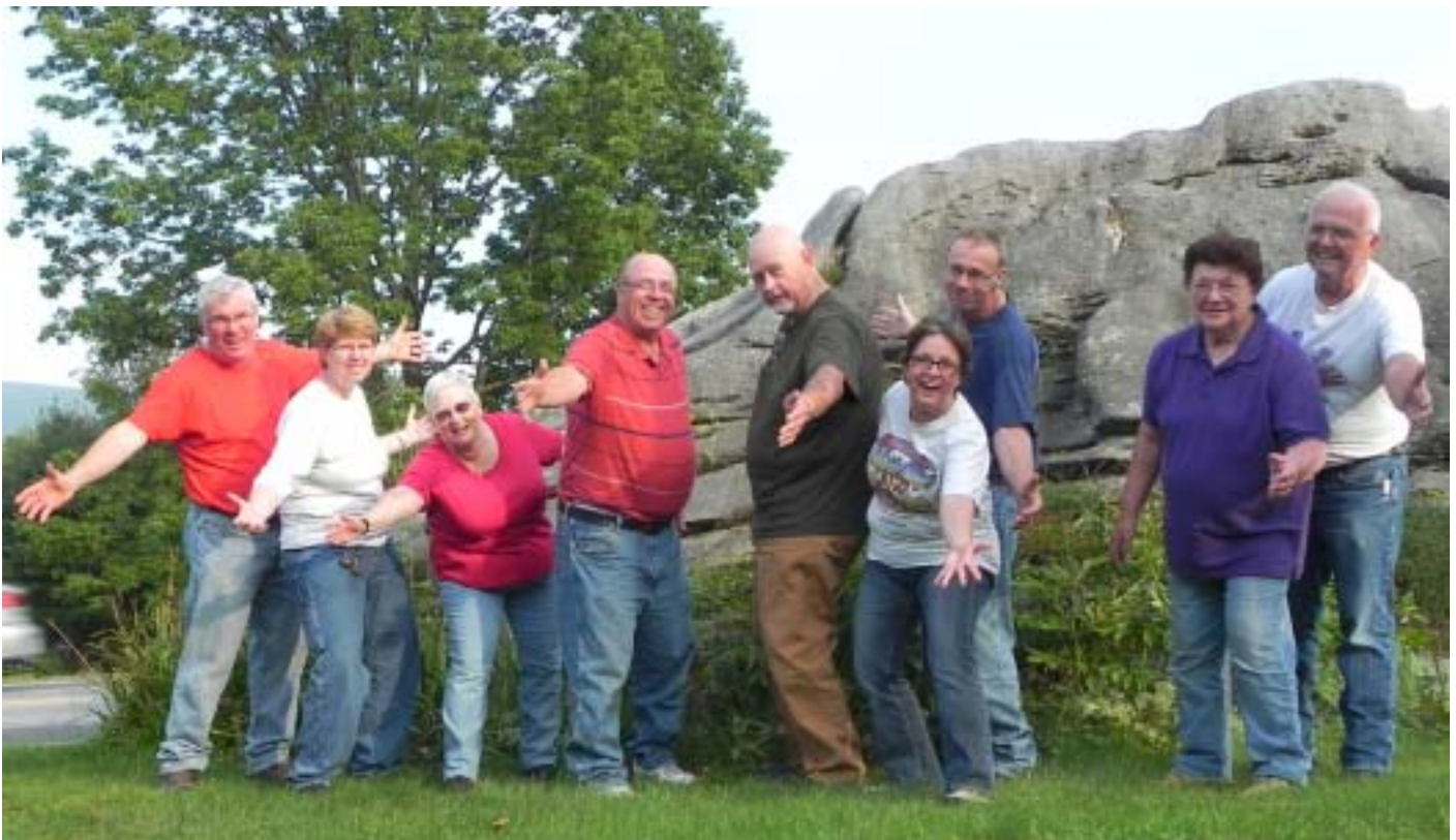
At Governor's Rock in Vt.