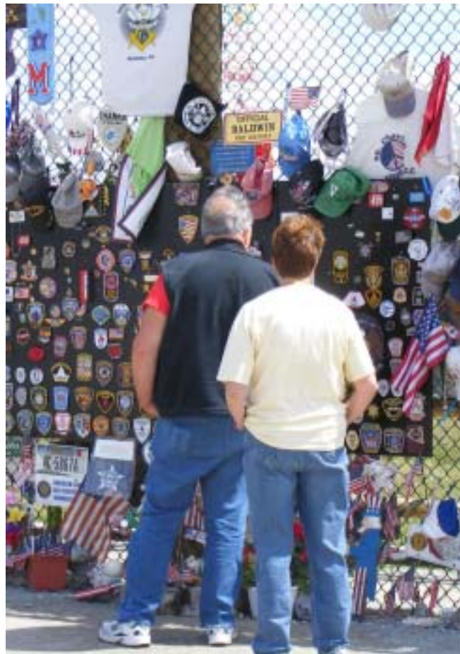
Guess who and where and for a free 1 year subscription to The Winger, what is the date? Notice: I captured their most photogenic side.