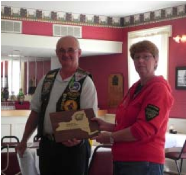
Getting the travel plaque from Chapter H