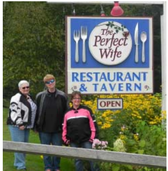
Were these the only wives there that qualified for this picture?