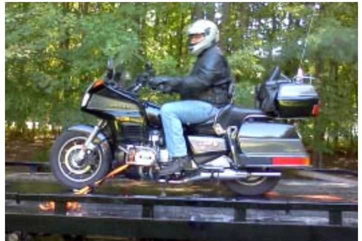
Dan Strong saving BIG BUCKS on gas.

This is also a great time to take a look at all of the normal maintenance items, such as tires, brake pads, filters, etc, that you may need to replace in the spring. This will give you all winter to source out the best prices and then have them on hand when spring breaks. Also, while looking, you may find that there may be additional needs for the bike that you may want to add to you Christmas list for the wife, oops, I mean Santa, such as more safety chrome.