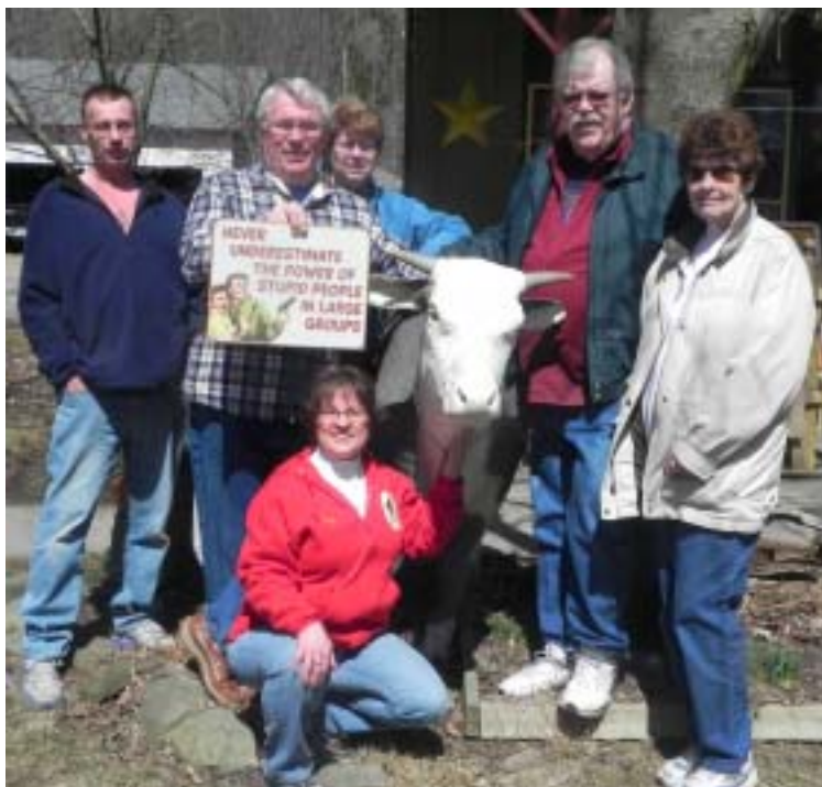
This picture was taken in front of one of the shops in Angilica.