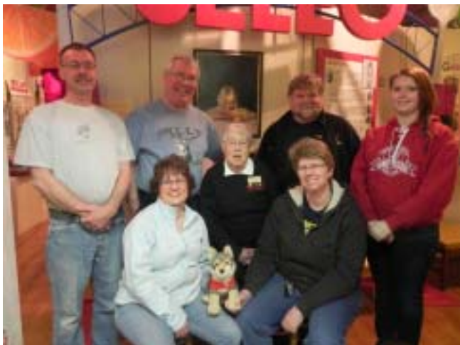
The Mello Goldwing owners at the Jello Museum in Leroy, NY