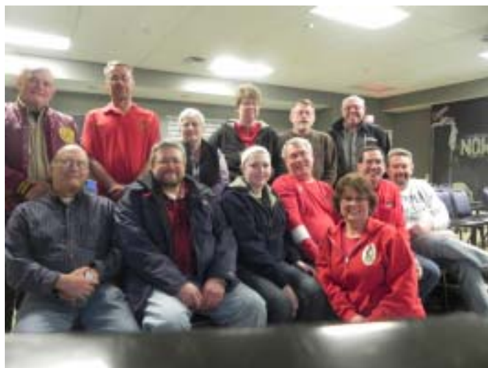
In April Chapter "W" held a Medic First Aid/CPR class. 11 were in attendance. Goofy Fixer was there too. He's still trying to figure out where the crankshaft and spark-plugs are located that make the heart run.