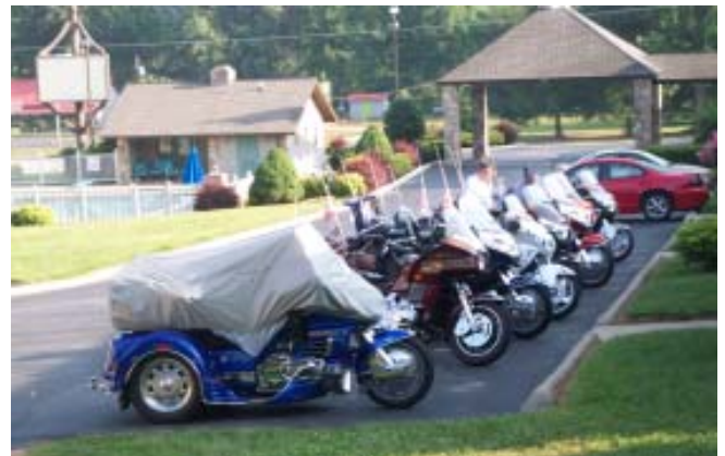
The Tally Ho Gang Chariots

Finally don't forget about the bi-State convention scheduled this month. Take advantage of the fact that it will be in our back yard this year and try to attend. Stay the week or stay just for a day. I have been involved with some of the planning and we all should have a good time. There are rides, seminars, vendors and parties planned. There should be a sign up page in this newsletter or you can go to http://gwrra-ny.org/bistateconvention2011.htm for more information.